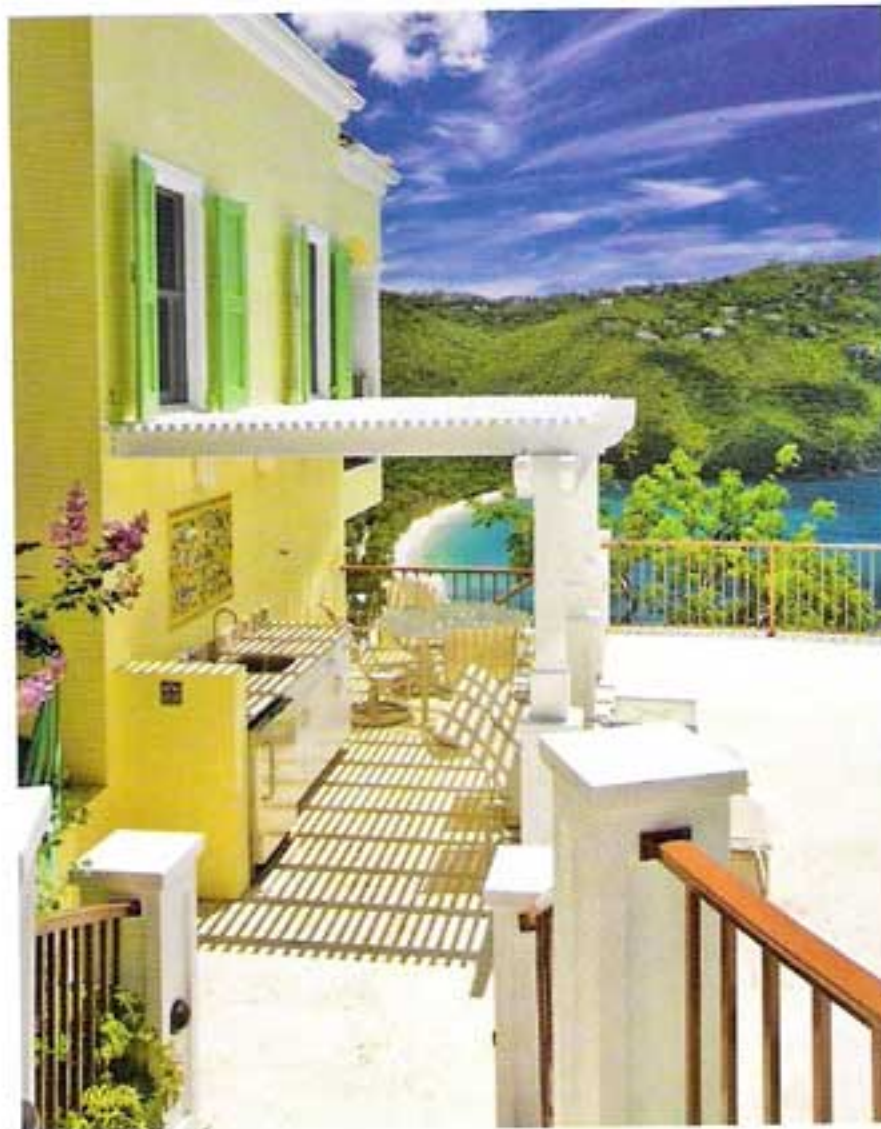
Ask your rental agent questions about any villa you want to rent and the surrounding area. Shown here is Star Garden on St. Thomas.