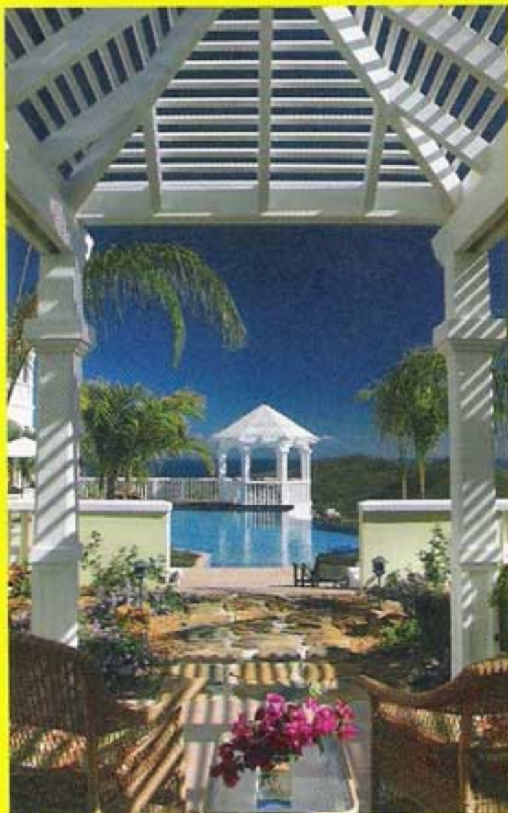
McLaughlin Anderson Luxury Villas