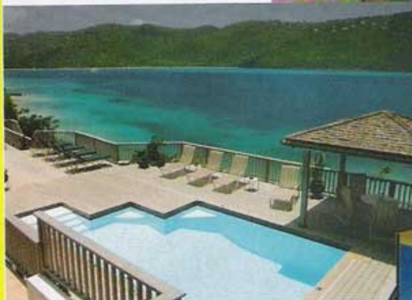
McLaughlin Anderson Luxury Villas

Picking an island is your first decision. Do you want nightlife and duty-free shopping along with good beaches? Then St. Thomas is your choice. If you want to while away your days at Virgin Islands National Park's beaches and hiking trails, then St. John is for you. Folks who enjoy history will love St. Croix. And Water Island attracts people who want to get away from it all, but still be close to St. Thomas' action.