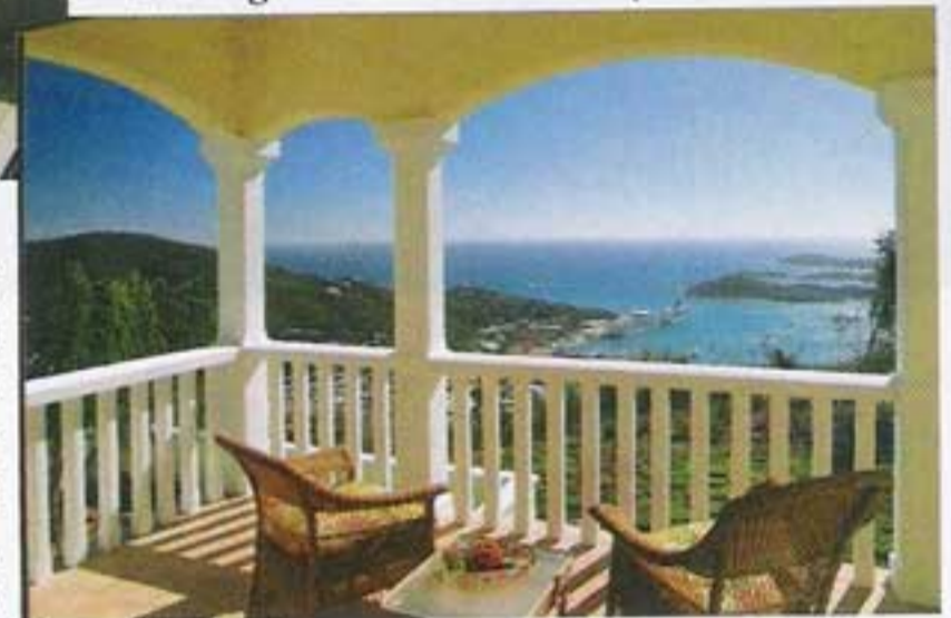
Cruz Bay Realty

free color villa catalog. John Foster Real Estate (340) 776-5000, Century 21, (340) 777-5700, Remax, (340) 775-9200 and Cruz Bay Realty, (340) 693-8808, also offer a selection of villas. Talk your requirements through with an agent. They'll match you up with choices in your price range or send you to another rental agent who can help.